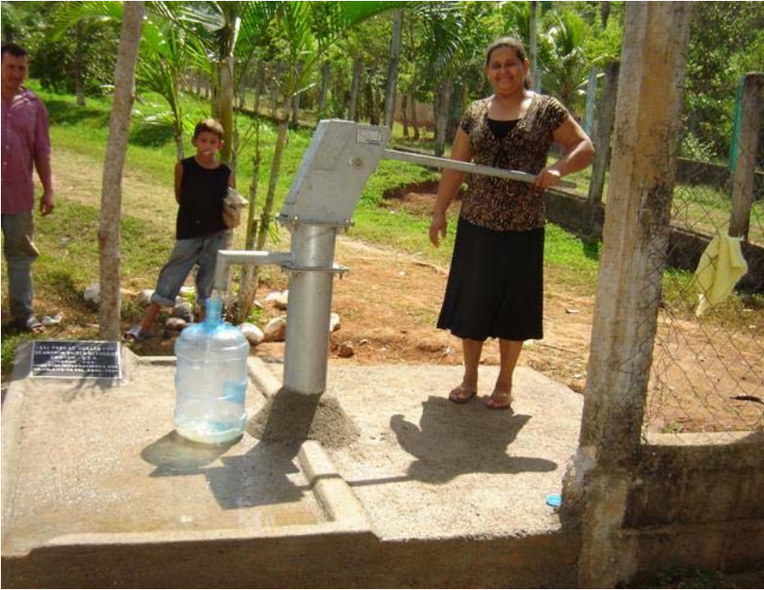
Community member pumping clean, safe drinking water.