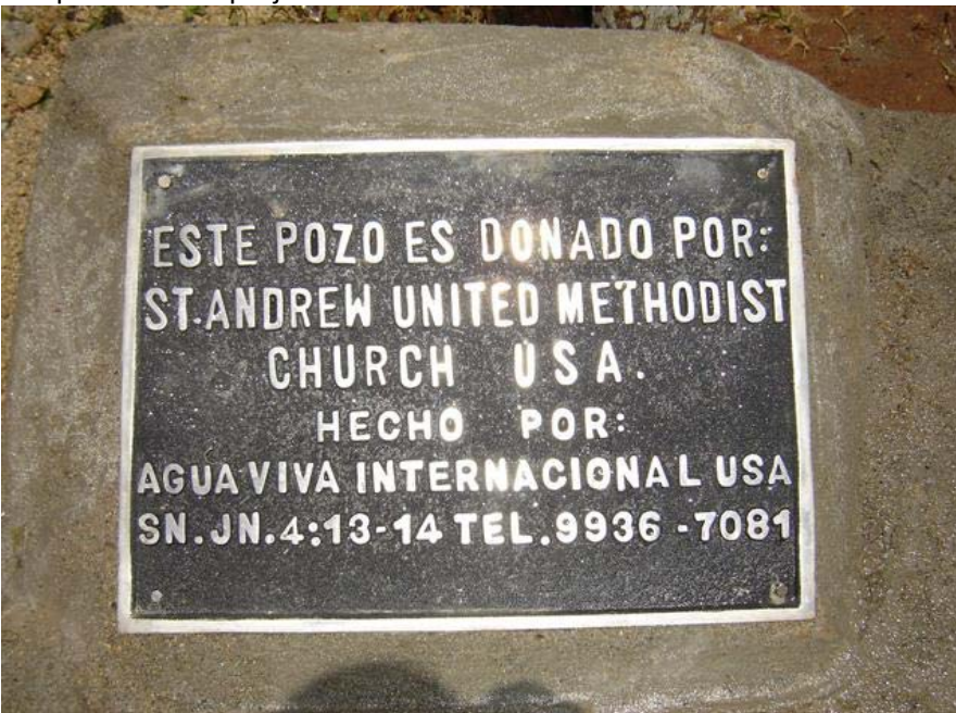
Close up of plaque.