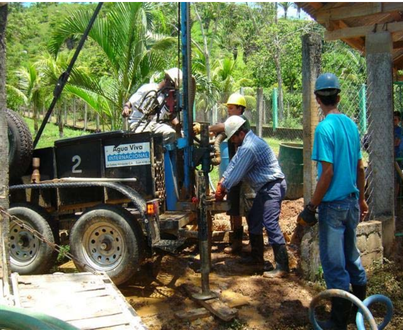
Project in process.