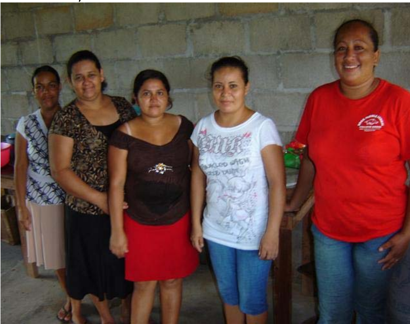
Water committee members responsible for maintaining the well and who were provided with a LWI Honduras contact number in case their well were to fall into disrepair, become subject to vandalism or theft.