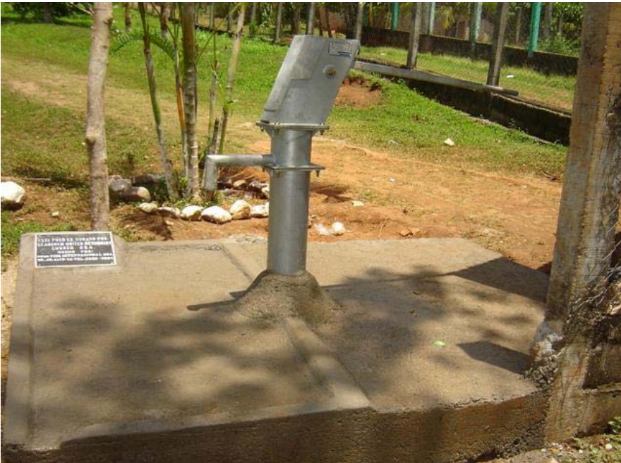
Completed water project.