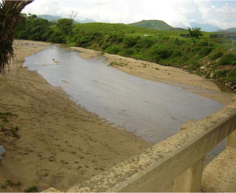
Previous water source.